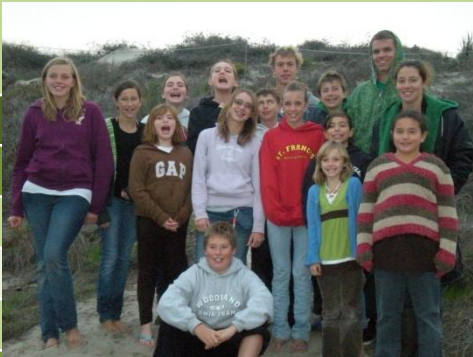
2009 Santa Cruz Team Travel Meet